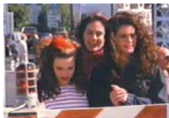
A VX100DG in a scene from the movie "Mystic Pizza" starring Julia Roberts. In Hollywood, they install fixtures upside down. You should always install fixture lamp base up.