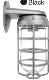
VBR100DG shown in Natural