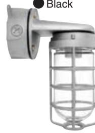
VXBR100DG shown in Natural