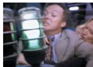
Best Supporting Prop in a movie! Here's a RAB Vaporproof in a scene from Ron Howard's "The Paper" starring Michael Keaton and Glenn Close. (When using outdoors, always install lamp base up.)