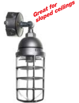
VA100DG shown in Natural