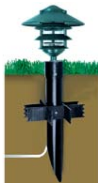
For sturdy Lawn Light mounting, use RAB Mighty Posts ® (see pages 116-117)