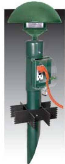
Turtle Power Post 19" Mighty Post with Turtle In-Use Cover for outlets & switches