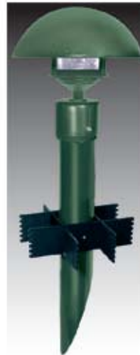
Mighty Post Mighty Post in lengths from 17" - 25" with a sturdy ground stabilizer