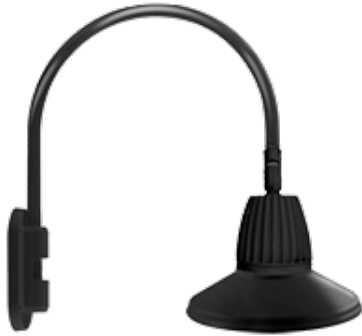
13 & 26 Watt Straight Shade LED Gooseneck Luminaire designed to match the architecture of Main Street storefronts and building perimeters. LED Gooseneck Straight Shade with Wall 20" High, 19" from Wall Goose Arm Style 4.