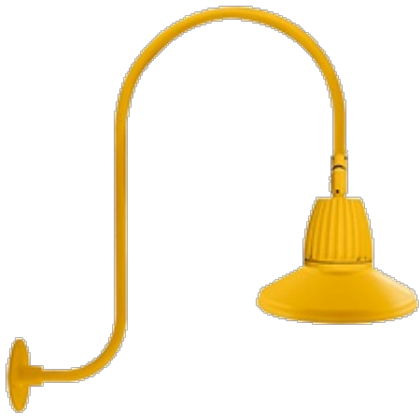
13 & 26 Watt Straight Shade LED Gooseneck Luminaire designed to match the architecture of Main Street storefronts and building perimeters. LED Gooseneck Straight Shade with Upcurve 30" High, 25" from Wall Goose Arm Style 3.