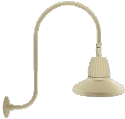
13 & 26 Watt Straight Shade LED Gooseneck Luminaire designed to match the architecture of Main Street storefronts and building perimeters. LED Gooseneck Straight Shade with Upcurve 30" High, 25" from Wall Goose Arm Style 3.