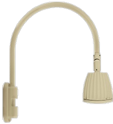
13 & 26 Watt No Shade LED Gooseneck Luminaire designed to match the architecture of Main Street storefronts and building perimeters. LED Gooseneck No Shade with Pole 20" High, 19" from Pole Goose Arm Style 5.