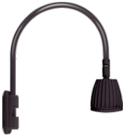
13 & 26 Watt No Shade LED Gooseneck Luminaire designed to match the architecture of Main Street storefronts and building perimeters. LED Gooseneck No Shade with Pole 20" High, 19" from Pole Goose Arm Style 5.