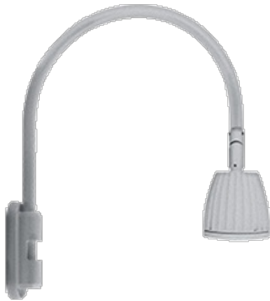
13 & 26 Watt No Shade LED Gooseneck Luminaire designed to match the architecture of Main Street storefronts and building perimeters. LED Gooseneck No Shade with Pole 20" High, 19" from Pole Goose Arm Style 5.