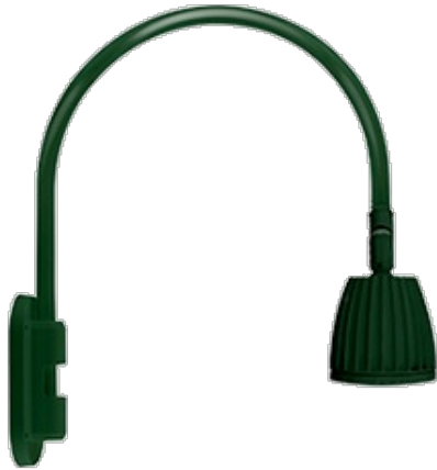
13 & 26 Watt No Shade LED Gooseneck Luminaire designed to match the architecture of Main Street storefronts and building perimeters. LED Gooseneck No Shade with Wall 20" High, 19" from Wall Goose Arm Style 4.