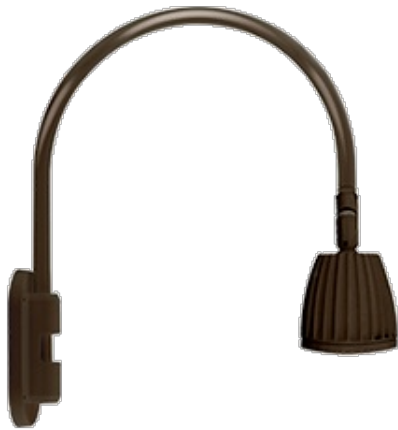
13 & 26 Watt No Shade LED Gooseneck Luminaire designed to match the architecture of Main Street storefronts and building perimeters. LED Gooseneck No Shade with Wall 20" High, 19" from Wall Goose Arm Style 4.