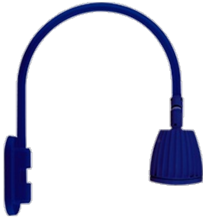
13 & 26 Watt No Shade LED Gooseneck Luminaire designed to match the architecture of Main Street storefronts and building perimeters. LED Gooseneck No Shade with Wall 20" High, 19" from Wall Goose Arm Style 4.