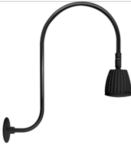
13 & 26 Watt No Shade LED Gooseneck Luminaire designed to match the architecture of Main Street storefronts and building perimeters. LED Gooseneck No Shade with Upcurve 30" High, 25" from Wall Goose Arm Style 3.