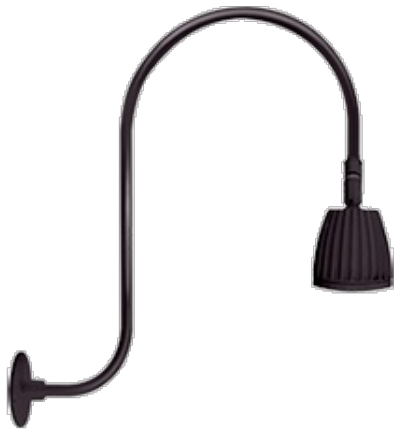
13 & 26 Watt No Shade LED Gooseneck Luminaire designed to match the architecture of Main Street storefronts and building perimeters. LED Gooseneck No Shade with Upcurve 30" High, 25" from Wall Goose Arm Style 3.