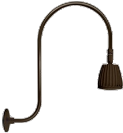
13 & 26 Watt No Shade LED Gooseneck Luminaire designed to match the architecture of Main Street storefronts and building perimeters. LED Gooseneck No Shade with Upcurve 30" High, 25" from Wall Goose Arm Style 3.