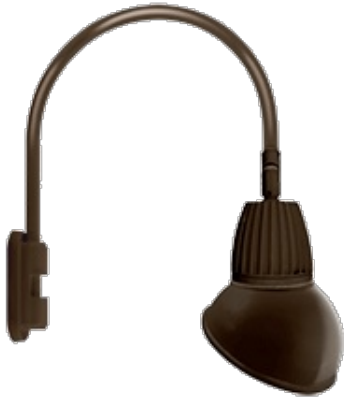
13 & 26 Watt Dome Shade LED Gooseneck Luminaire designed to match the architecture of Main Street storefronts and building perimeters. LED Gooseneck Dome Shade with Pole 20" High, 19" from Pole Goose Arm Style 5.