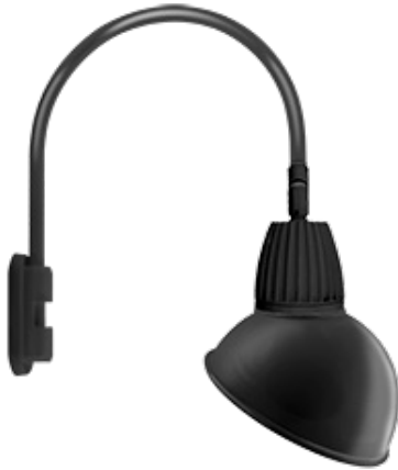
13 & 26 Watt Dome Shade LED Gooseneck Luminaire designed to match the architecture of Main Street storefronts and building perimeters. LED Gooseneck Dome Shade with Pole 20" High, 19" from Pole Goose Arm Style 5.