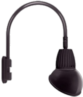
13 & 26 Watt Dome Shade LED Gooseneck Luminaire designed to match the architecture of Main Street storefronts and building perimeters. LED Gooseneck Dome Shade with Pole 20" High, 19" from Pole Goose Arm Style 5.