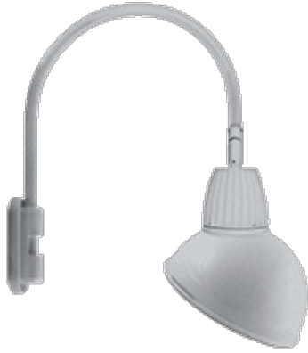
13 & 26 Watt Dome Shade LED Gooseneck Luminaire designed to match the architecture of Main Street storefronts and building perimeters. LED Gooseneck Dome Shade with Pole 20" High, 19" from Pole Goose Arm Style 5.