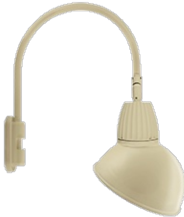
13 & 26 Watt Dome Shade LED Gooseneck Luminaire designed to match the architecture of Main Street storefronts and building perimeters. LED Gooseneck Dome Shade with Pole 20" High, 19" from Pole Goose Arm Style 5.