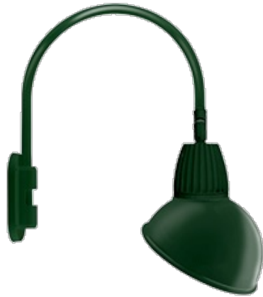
13 & 26 Watt Dome Shade LED Gooseneck Luminaire designed to match the architecture of Main Street storefronts and building perimeters. LED Gooseneck Dome Shade with Wall 20" High, 19" from Wall Goose Arm Style 4.