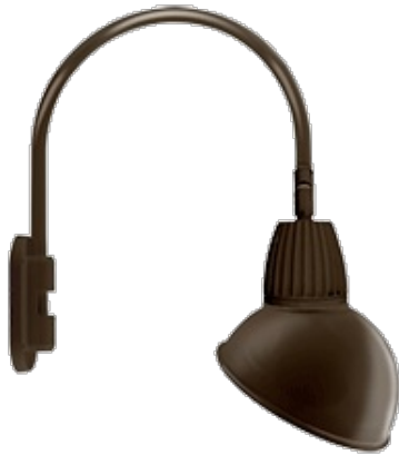
13 & 26 Watt Dome Shade LED Gooseneck Luminaire designed to match the architecture of Main Street storefronts and building perimeters. LED Gooseneck Dome Shade with Wall 20" High, 19" from Wall Goose Arm Style 4.