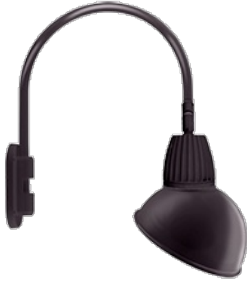
13 & 26 Watt Dome Shade LED Gooseneck Luminaire designed to match the architecture of Main Street storefronts and building perimeters. LED Gooseneck Dome Shade with Wall 20" High, 19" from Wall Goose Arm Style 4.