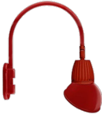
13 & 26 Watt Dome Shade LED Gooseneck Luminaire designed to match the architecture of Main Street storefronts and building perimeters. LED Gooseneck Dome Shade with Wall 20" High, 19" from Wall Goose Arm Style 4.