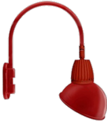
13 & 26 Watt Dome Shade LED Gooseneck Luminaire designed to match the architecture of Main Street storefronts and building perimeters. LED Gooseneck Dome Shade with Wall 20" High, 19" from Wall Goose Arm Style 4.