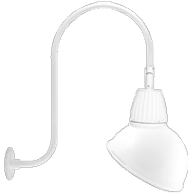
13 & 26 Watt Dome Shade LED Gooseneck Luminaire designed to match the architecture of Main Street storefronts and building perimeters. LED Gooseneck Dome Shade with Upcurve 30" High, 25" from Wall Goose Arm Style 3.