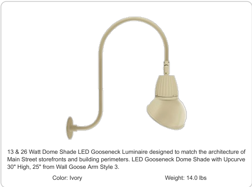
13 & 26 Watt Dome Shade LED Gooseneck Luminaire designed to match the architecture of Main Street storefronts and building perimeters. LED Gooseneck Dome Shade with Upcurve 30" High, 25" from Wall Goose Arm Style 3.