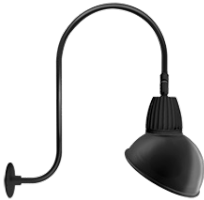
13 & 26 Watt Dome Shade LED Gooseneck Luminaire designed to match the architecture of Main Street storefronts and building perimeters. LED Gooseneck Dome Shade with Upcurve 30" High, 25" from Wall Goose Arm Style 3.