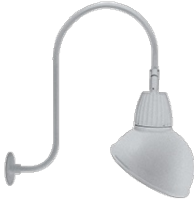
13 & 26 Watt Dome Shade LED Gooseneck Luminaire designed to match the architecture of Main Street storefronts and building perimeters. LED Gooseneck Dome Shade with Upcurve 30" High, 25" from Wall Goose Arm Style 3.