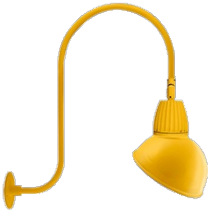
13 & 26 Watt Dome Shade LED Gooseneck Luminaire designed to match the architecture of Main Street storefronts and building perimeters. LED Gooseneck Dome Shade with Upcurve 30" High, 25" from Wall Goose Arm Style 3.