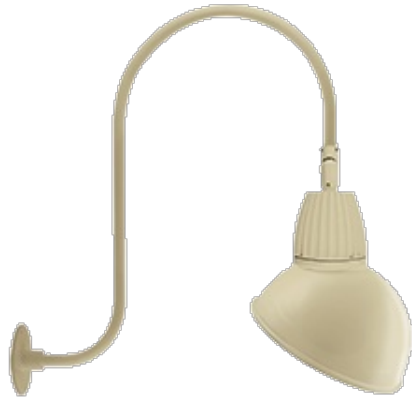
13 & 26 Watt Dome Shade LED Gooseneck Luminaire designed to match the architecture of Main Street storefronts and building perimeters. LED Gooseneck Dome Shade with Upcurve 30" High, 25" from Wall Goose Arm Style 3.