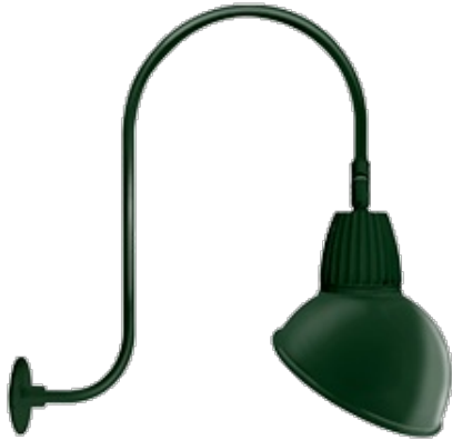
13 & 26 Watt Dome Shade LED Gooseneck Luminaire designed to match the architecture of Main Street storefronts and building perimeters. LED Gooseneck Dome Shade with Upcurve 30" High, 25" from Wall Goose Arm Style 3.