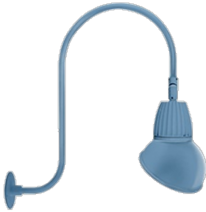
13 & 26 Watt Dome Shade LED Gooseneck Luminaire designed to match the architecture of Main Street storefronts and building perimeters. LED Gooseneck Dome Shade with Upcurve 30" High, 25" from Wall Goose Arm Style 3.