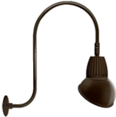
13 & 26 Watt Dome Shade LED Gooseneck Luminaire designed to match the architecture of Main Street storefronts and building perimeters. LED Gooseneck Dome Shade with Upcurve 30" High, 25" from Wall Goose Arm Style 3.