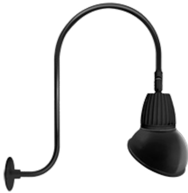
13 & 26 Watt Dome Shade LED Gooseneck Luminaire designed to match the architecture of Main Street storefronts and building perimeters. LED Gooseneck Dome Shade with Upcurve 30" High, 25" from Wall Goose Arm Style 3.