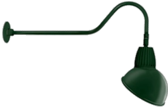
13 & 26 Watt Dome Shade LED Gooseneck Luminaire designed to match the architecture of Main Street storefronts and building perimeters. LED Gooseneck Dome Shade with 35" Goose Arm Style 2.