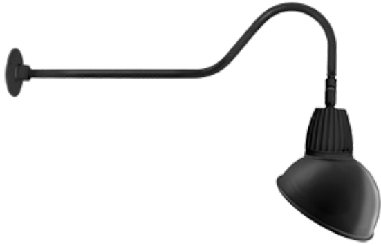
13 & 26 Watt Dome Shade LED Gooseneck Luminaire designed to match the architecture of Main Street storefronts and building perimeters. LED Gooseneck Dome Shade with 35" Goose Arm Style 2.