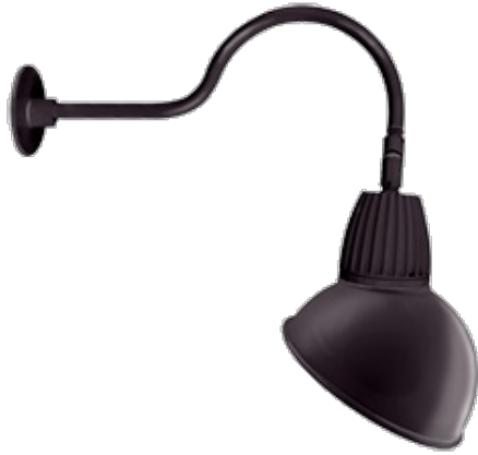
13 & 26 Watt Dome Shade LED Gooseneck Luminaire designed to match the architecture of Main Street storefronts and building perimeters. LED Gooseneck Dome Shade with 24" Goose Arm Style 1.