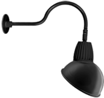
13 & 26 Watt Dome Shade LED Gooseneck Luminaire designed to match the architecture of Main Street storefronts and building perimeters. LED Gooseneck Dome Shade with 24" Goose Arm Style 1.