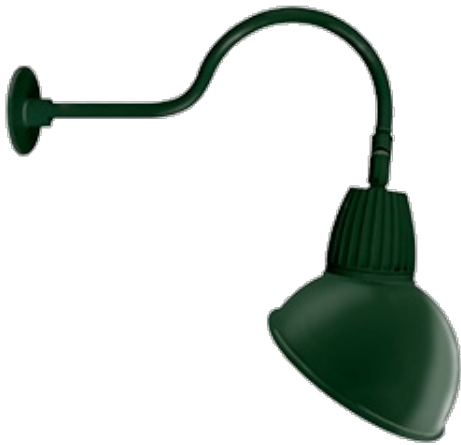
13 & 26 Watt Dome Shade LED Gooseneck Luminaire designed to match the architecture of Main Street storefronts and building perimeters. LED Gooseneck Dome Shade with 24" Goose Arm Style 1.