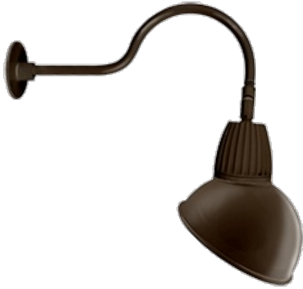
13 & 26 Watt Dome Shade LED Gooseneck Luminaire designed to match the architecture of Main Street storefronts and building perimeters. LED Gooseneck Dome Shade with 24" Goose Arm Style 1.