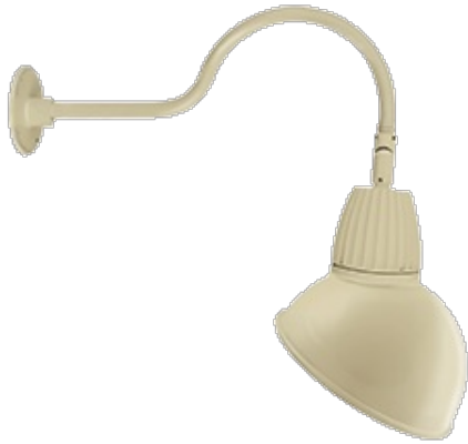
13 & 26 Watt Dome Shade LED Gooseneck Luminaire designed to match the architecture of Main Street storefronts and building perimeters. LED Gooseneck Dome Shade with 24" Goose Arm Style 1.