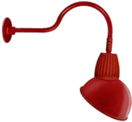
13 & 26 Watt Dome Shade LED Gooseneck Luminaire designed to match the architecture of Main Street storefronts and building perimeters. LED Gooseneck Dome Shade with 24" Goose Arm Style 1.