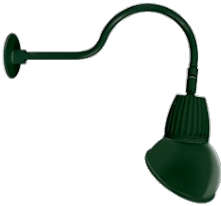
13 & 26 Watt Dome Shade LED Gooseneck Luminaire designed to match the architecture of Main Street storefronts and building perimeters. LED Gooseneck Dome Shade with 24" Goose Arm Style 1.