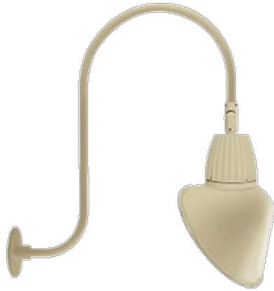
13 & 26 Watt Angled Cone Shade LED Gooseneck Luminaire designed to match the architecture of Main Street storefronts and building perimeters. LED Gooseneck Cone Shade with Upcurve 30" High, 25" from Wall Goose Arm Style 3.