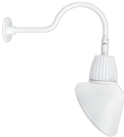
13 & 26 Watt Angled Cone Shade LED Gooseneck Luminaire designed to match the architecture of Main Street storefronts and building perimeters. LED Gooseneck Cone Shade with 24" Goose Arm Style 1.