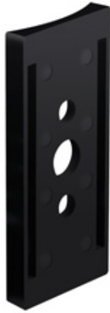
Pole adaptors for ALED Area Lights Color: Bronze