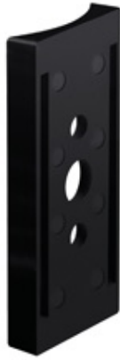
Pole adaptors for ALED Area Lights Color: Bronze