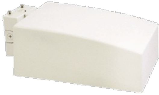
Type II distribution flat wall mount Area Light with 4" arm for use at 10' - 15' height. Fixed mounting at 90° to wall. Lamp supplied