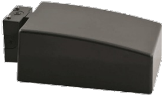
Type II distribution flat wall mount Area Light with 4" arm for use at 10' - 15' height. Fixed mounting at 90° to wall. Lamp supplied